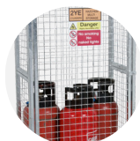
Gorilla Gas Cage GGC3