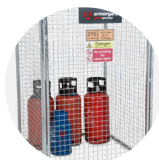
Gorilla Gas Cage GGC6